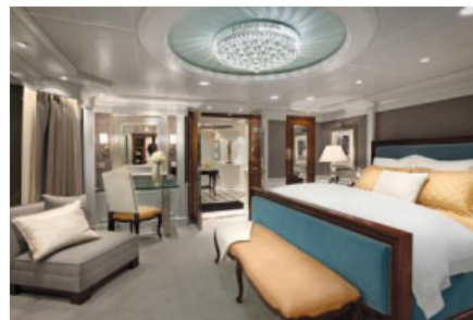
Owners Suite - Approx. 2,000 ft 2