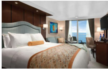
Verandah Stateroom Approx. 282 ft 2 (incl balcony)