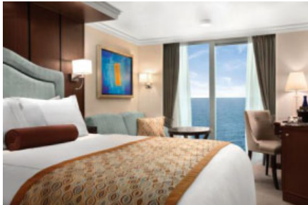
Deluxe Ocean View - Approx. 242 ft 2